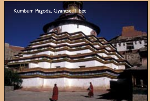
Kumbum Pagoda, Gyantse, Tibet

Day 8-10, COCHIN - Short drive to Cochin. Tour of Jewish Town, Synagogue and enjoy Kathakali dance performance. Transfers, tours, drives and 9 nights in your choice of hotels.