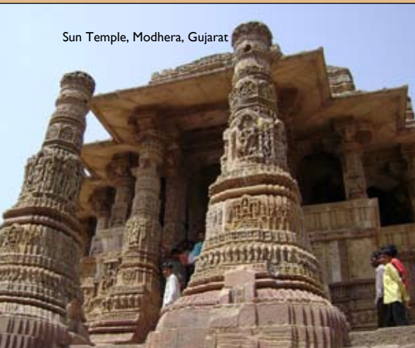
Sun Temple, Modhera, Gujarat

Day 7-10, BHUJ - Drive to Bhuj. Two days visit to ethnic villages to see their arts and crafts. Transfers, tours, drives and 9 nights in 3-4 star hotels.