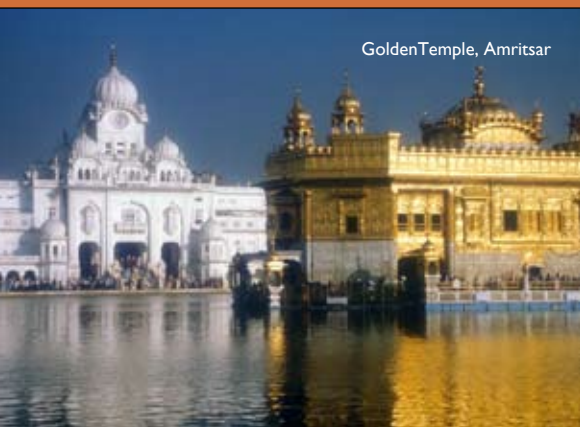
Golden Temple, Amritsar

Day 2-4, DHARAMSALA - Drive to Dharamsala. Tour of McLeod Ganj,