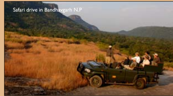
Safari drive in Bandhavgarh N.P

Day 2-3, CHIKMAGALUR - Drive to Hospet. Tour of the Hampi ruins.